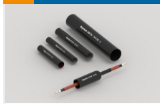
Power Cable Tubing & Accessories(93)